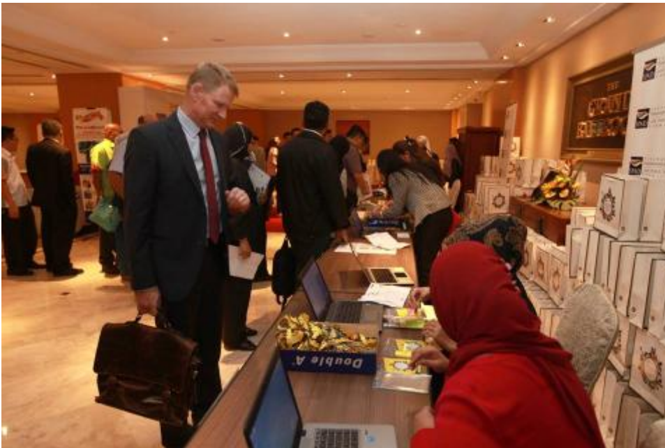
LPT 2015 - Symposium [8] Rabu, 18 November 2015