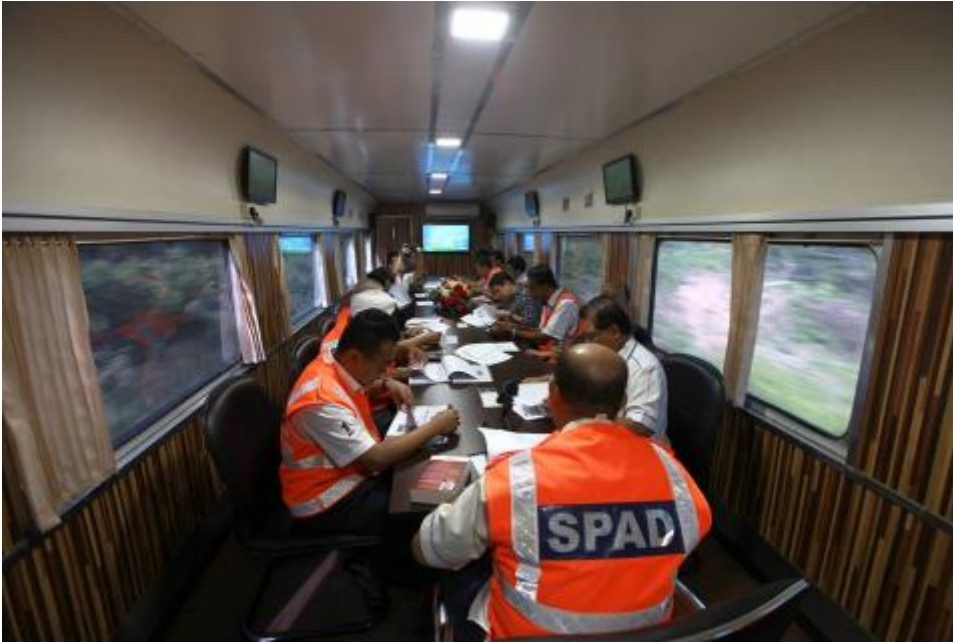
Lawatan Kerja Pengurusan SPAD ke Jajaran Keretapi Gemas-Tumpat [6] Isnin, 7 Disember 2015