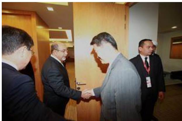
Kunjungan Hormat Menteri Perdagangan Industri dan Tenaga Korea [16] Isnin, 24 Ogos 2015

« first [17] ? previous [18] 1 [17] 2 [18] 3 4 [19] 5 [20] 6 [21] 7 [22] 8 [23] 9 [24] ? next [19] ? last [25] »