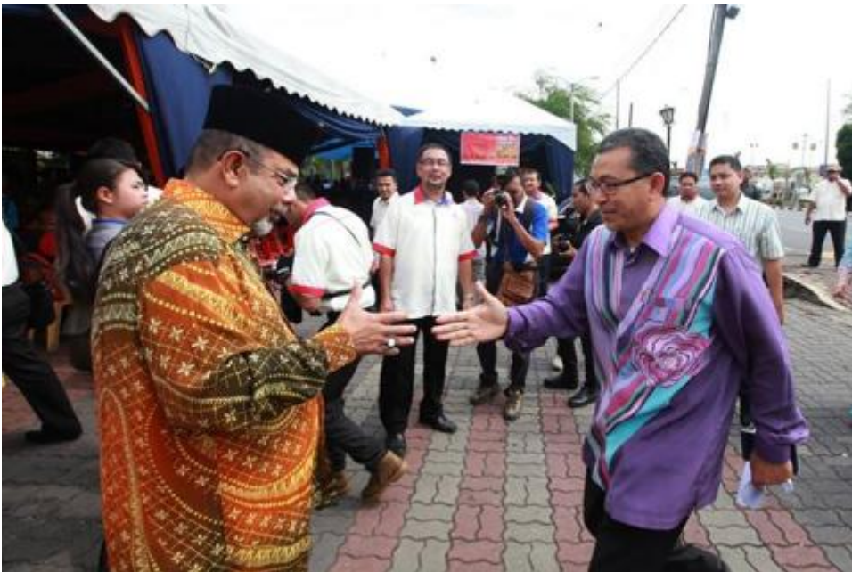
Majlis Perasmian myBAS bagi Negeri Perlis Indera Kayangan [12] Khamis, 3 September 2015 •