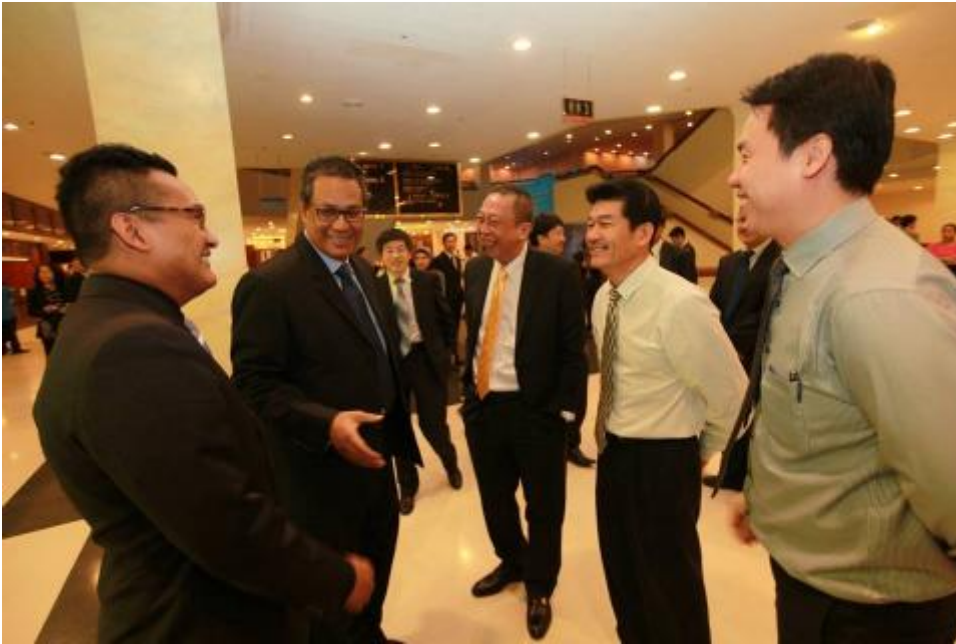
LPT 2015 - Gala Dinner & Industry Awards [10] Rabu, 18 November 2015